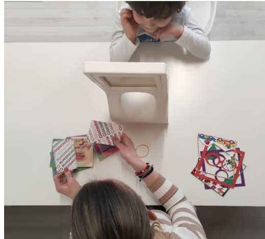
Figure 2: Giocostorie—cards and masks

Cards and masks are used during therapy to build the stories that support the facial expressions and postures