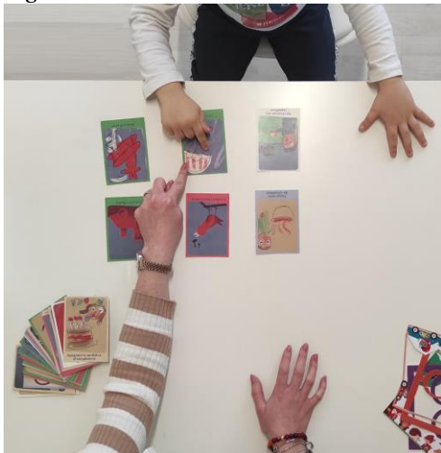
Figure 3: Giocostorie—stories

The patient can use playing cards to personalise their story. Involving the child in the choice of stories aims to reduce the risk of boredom and fatigue.