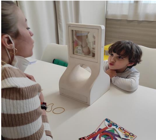
Figure 1: Giocostorie—postures

The speech therapist uses the two-way mirror to show the patient the postures. The patient observes and imitates the speech therapist and visually checks the compliance of their gestures.