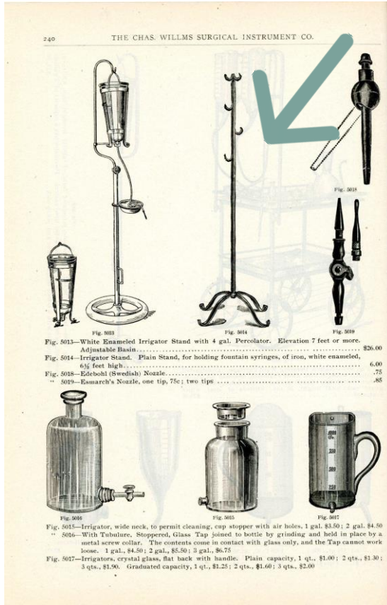
Charles Willms Surgical Instrument Co. Illustrated and Descriptive Catalogue and Price-List of Surgical Instruments [catalogue]. Baltimore (MD): 1905 (240) 4

The prototype design focused on three major components: 1) an intuitive, comfortable handle for manoeuvring; 2) the ability to adapt between walking and stationary states; and 3) a stable base, with implied directionality and gait allowance (Figure 2).