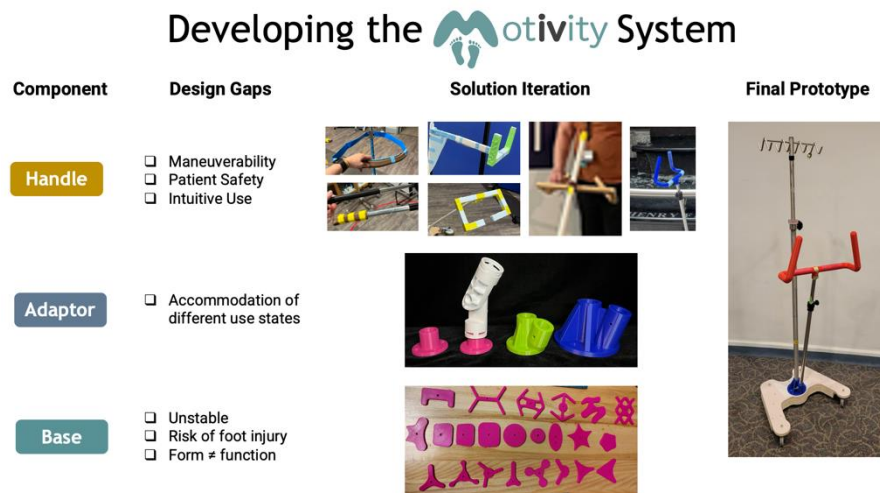
Figure 3: Prototyping Motivity

Stability was a major factor in our design, as existing poles tend to be unstable and top-heavy. The prototype featured a central pole recess within the base, secured with a bolt and lock washer, and was tested with large shakes, while loaded with pumps and IV bags. Including a silicone cap would protect the moving components in the base (Figure 2B), enhancing its feasibility for infection control in the healthcare setting. Force diagram models support findings from prototype testing and demonstrate that Motivity’s lower centre of mass versus the traditional IV pole provides increased resistance to tipping (Figure 2C).